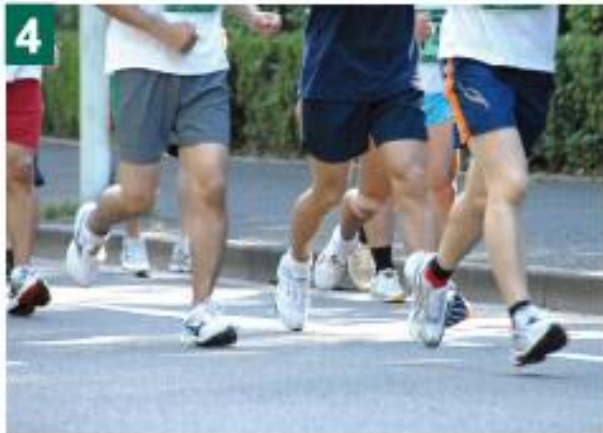
Take part in a charity marathon

Have a conversation with your teacher using “whatever”, “whoever” or “whichever” and the pictures below. You may use the words under each picture, but try to use your own words as much as possible.