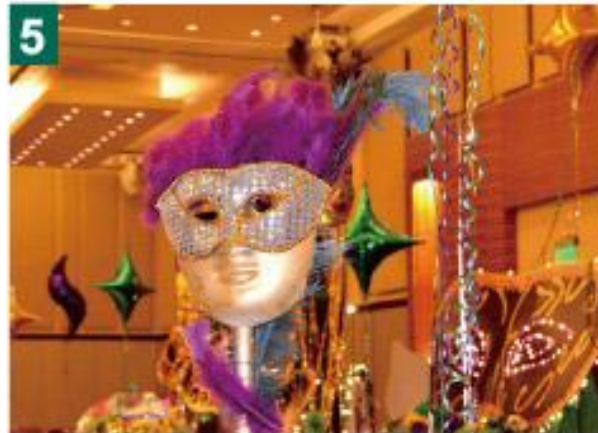
Wear party masks