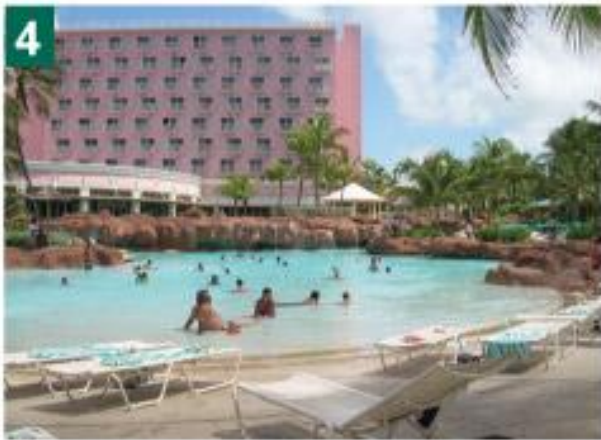
Hotel Swimming pool

Talk about the pictures to your teacher using “whose” (You could first make a sentence with “a noun + which/that” and change it to a sentence with “whose”).