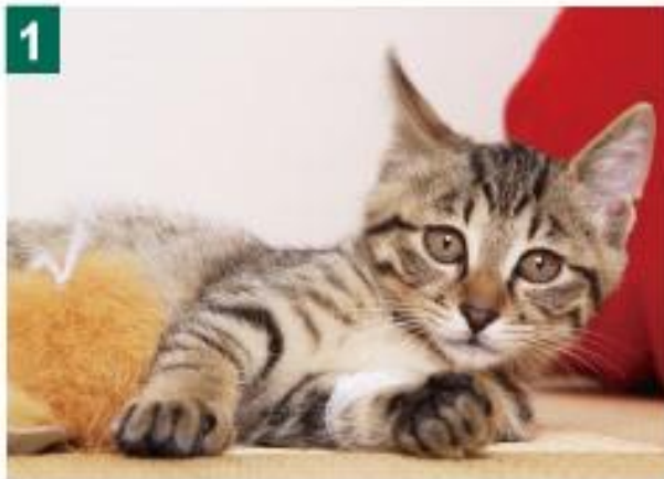
1 My cat Bobbie

My cat whose name is Bobbie is always sleeping.