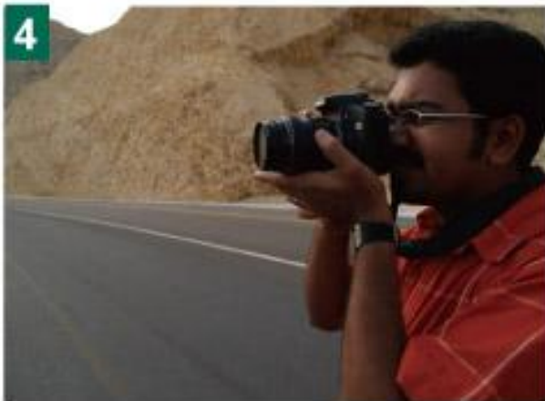
You taking a photo

Explain the pictures to your teacher using “when”. You may use the words given below the pictures.