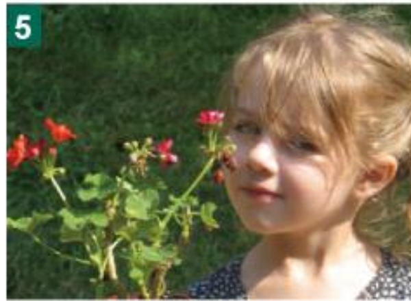
A girl birthday