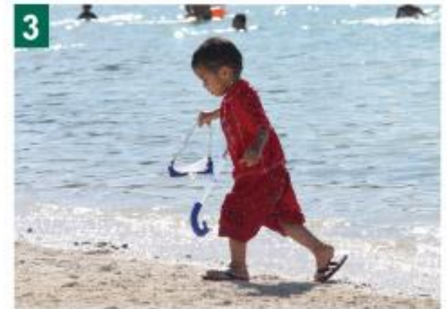
3 The boy cute