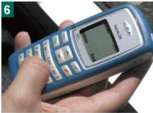
A friend's cell phone

Talk about the pictures to your teacher using “whose” (You could first make a sentence with “a noun + which/that” and change it to a sentence with “whose”).