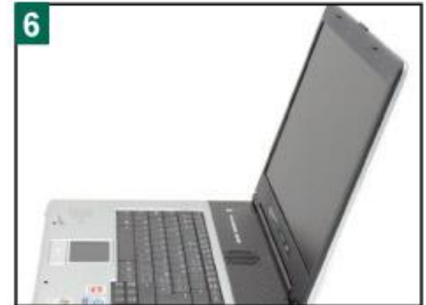
Buying a new laptop