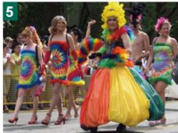
Parade takes place