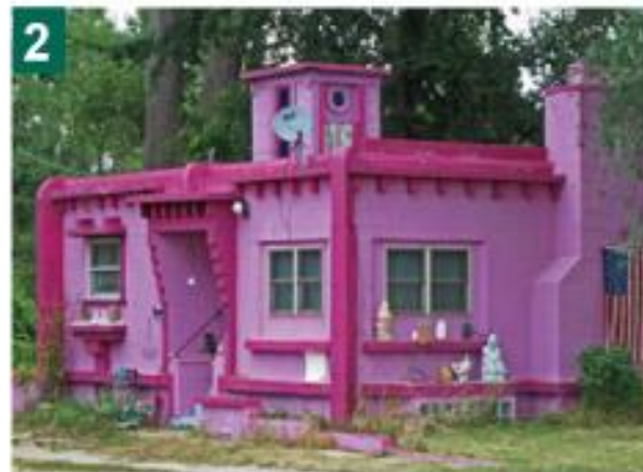
2 Pink house

My cat whose name is Bobbie is always sleeping.