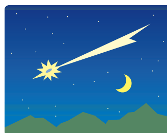
15. shooting star